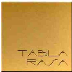
Tabla Rasa Gallery

Gallery Diversity Artists Artist Submissions Contact Us