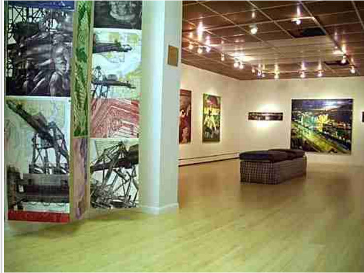
Click here for the above image of Tabla Rasa Gallery 300dpi